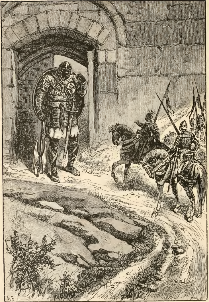
Kai and His Companions at the Castle of the Giant Gwrnach.